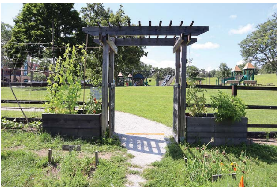
Figure 2. The new raised garden beds are within accessible reach ranges: 2' high x 2' deep x 4' wide. (The gate is shown open here, with a yardstick for scale.)