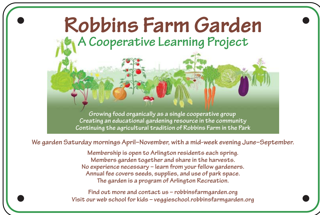
Figure 5. Artwork for new aluminum sign installed at garden entrance (actual size: 12" x 18")