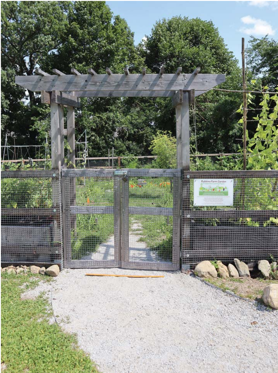
Figure 1. The new garden gate showing the accessible stone dust path to the Eastern Avenue sidewalk, the entry arbor with a nominal 5' wide gate opening (with a yardstick on the path for scale), and the garden sign (detailed in Figure 5).